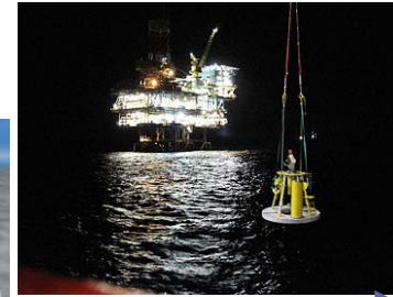
Real time environmental monitoring